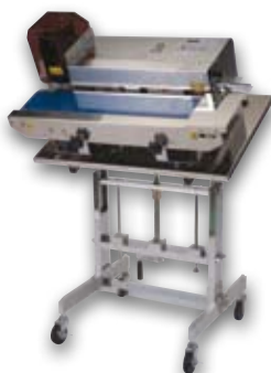
SE-SBTA132-10D PP-BA with special stand

A special stand is available for situations where you cannot secure adequate working space otherwise. The mounting can be adjusted to hold the sealer from a horizontal position up to a tilt of 20 degrees. The below picture shows the mounting tilted 20 degrees.